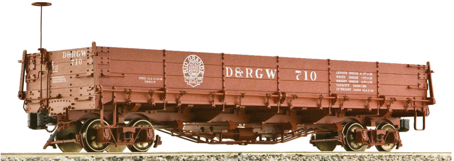
D&RGW w/ MOFFAT LOGO