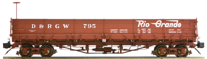
D&RGW FLYING RIO GRANDE